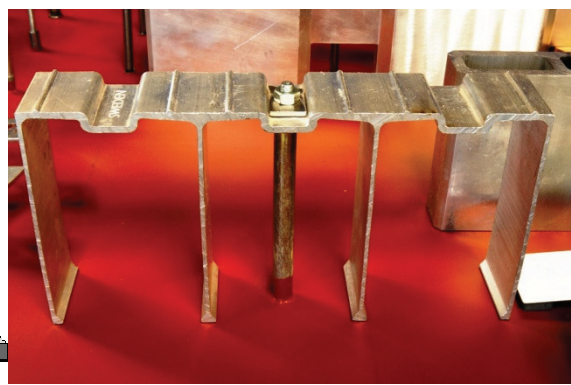
21.0 MB X 16 H In